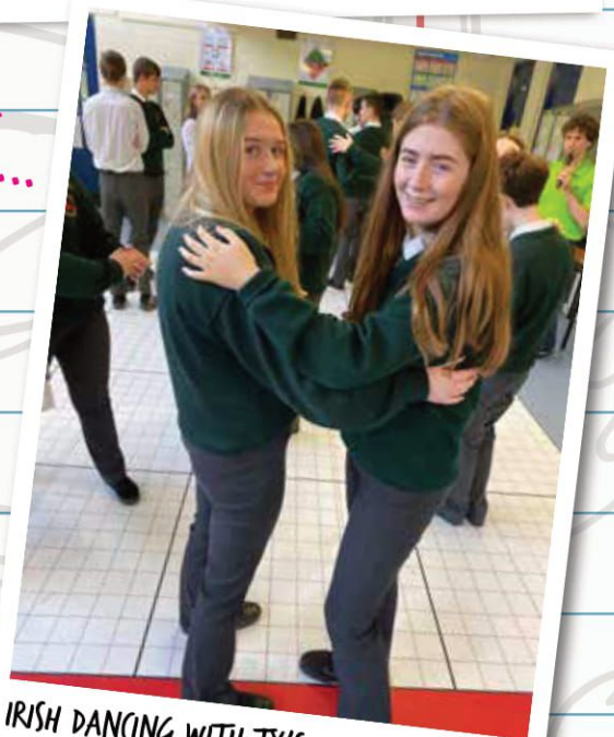
IRISH DANCING WITH TY'S