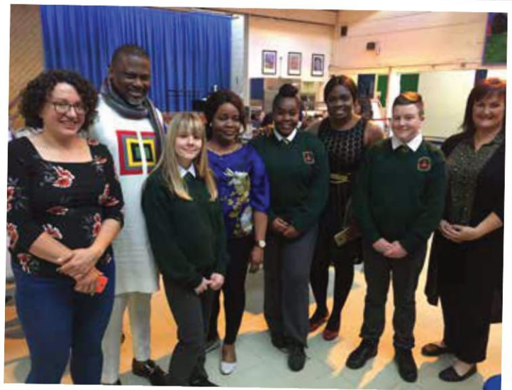
COFFEE MORNING FOR 1ST YEAR PARENTS