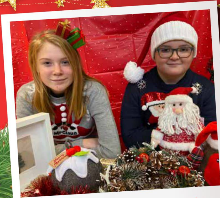
Hoping that 2020 brings peace and happiness to all, from Weronia and Lewis