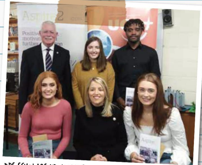
DPS SCHOLARSHIP AWARDS