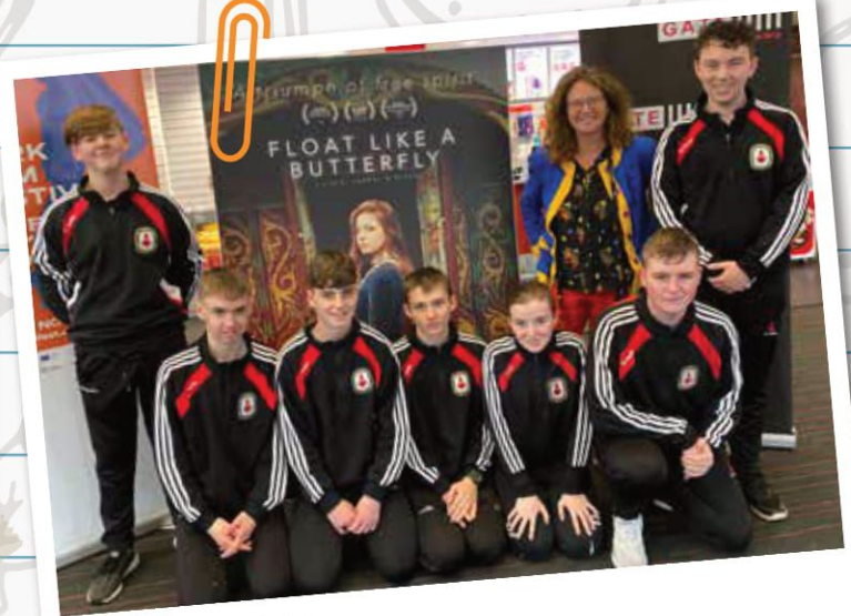
CORK FILM FESTIVAL