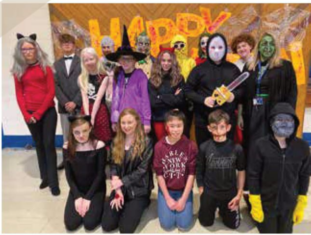
TRICK OR TREAT FOR TEMPLE STREET