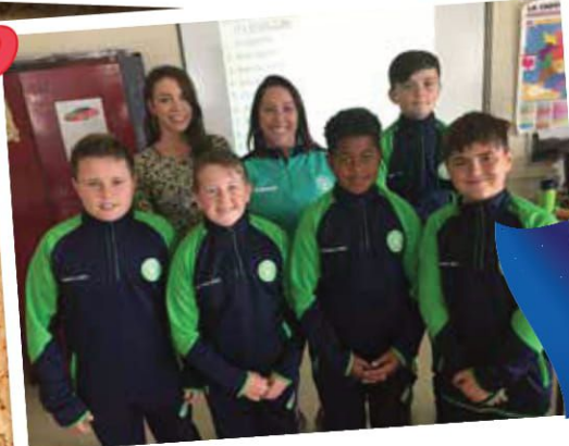
St Patricks visit French class