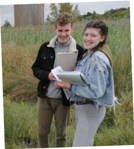
BIOLOGY FIELD TRIP