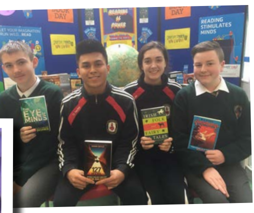
world Book day