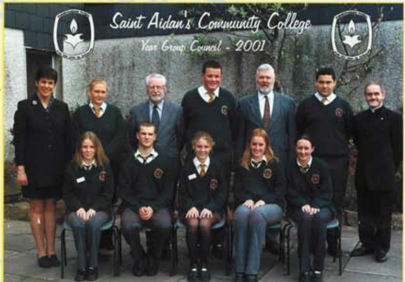
Photo: Year Group Council - Sixth Year 2001