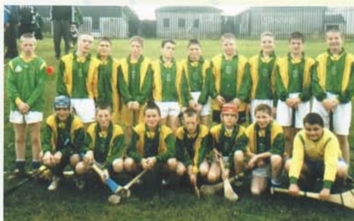
Photo: St. Aidan's Second Year Hurling Team.