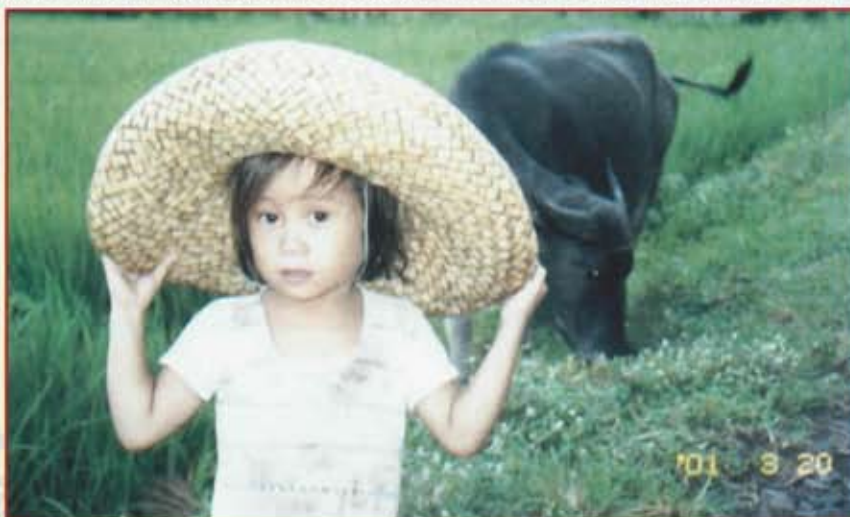
Photo: A little farming girl

Next morning's peace is shattered at 6.30am by the arrival of the 5000 elementary, high school and college students all neatly dressed in blue and white uniforms. They arrive for the education that, for them, is the key and the hope to a chance of a better life and an escape from the