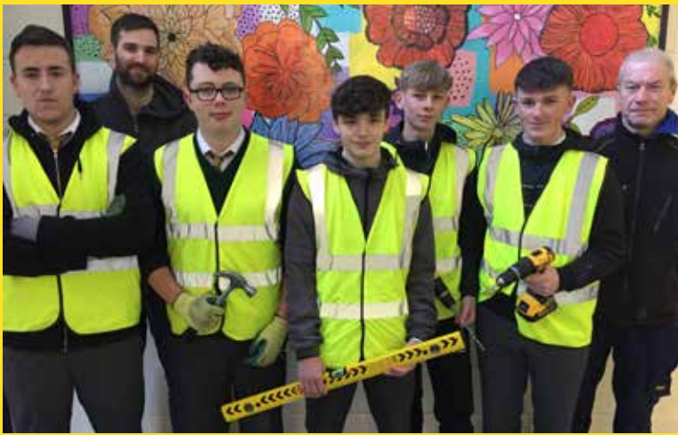
The TY Enterprise module has seen pupils put their creativity, entrepreneurship and communication skills to good use. A team of students have been busy maintaining the outdoor garden spaces while inside, a successful pop up café, a cinema day and raffle by AJS hampers were organised by our budding entrepreneurs.