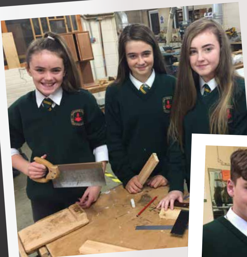
MATERIALS WOOD TECHNOLOGY