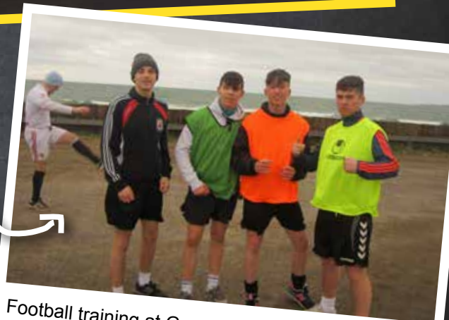
Football training at Garretstown beach, Co. Cork