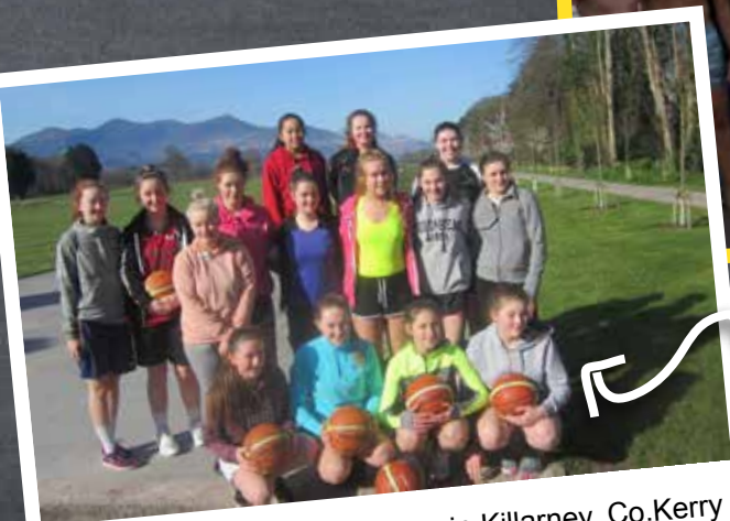
Girls' basketball training camp in Killarney, Co. Kerry