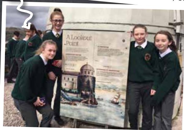
Science trip to Blackrock Castle Observatory