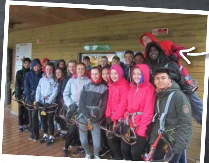
TY trip to Zipit, Farran Woods