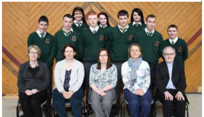
LCA Class Antoin