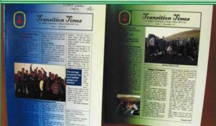
Photo left: Congratulations to our Transition Year students on the publication of the excellent Transition Times magazine. Well done to all involved.

Photo above: Some of the many articles from St. Aidan's which were published in the Evening Echo during this past year.