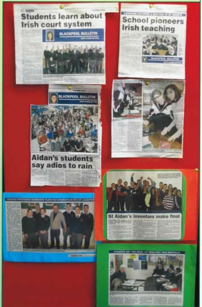
Photo above: Some of the many articles from St. Aidan's which were published in the Evening Echo during this past year.

Photo left: Congratulations to our Transition Year students on the publication of the excellent Transition Times magazine. Well done to all involved.