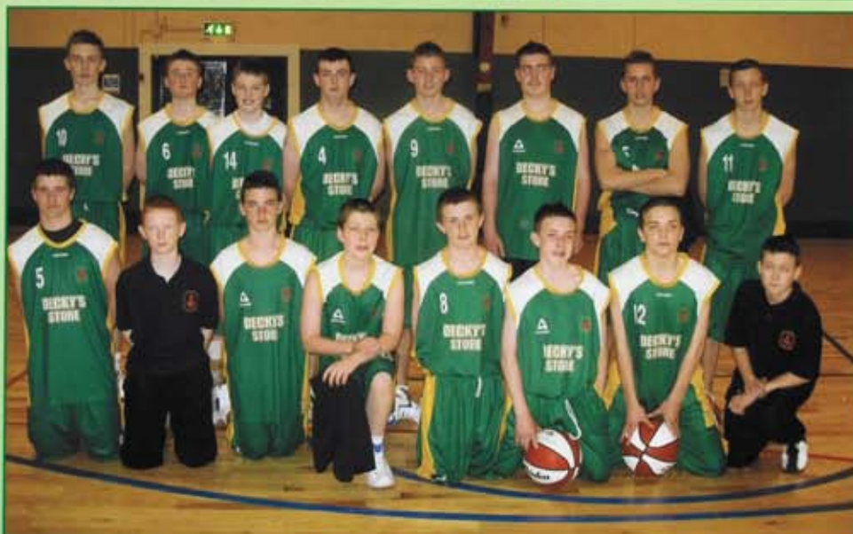
St. Aidans Basketball Ireland 2nd Year South League Finalists