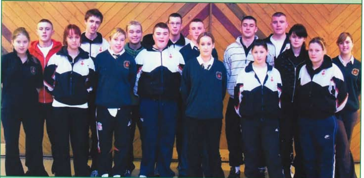
Photos: Top-Class Seamas. Bottom-Class Seosamh.

It feels like only yesterday we were walking through these doors as 1st years yet here we are today as 6th years. Back then 6th year seemed like a lifetime away and now as we gather here tonight to celebrate this momentous occasion in our lives it somehow feels surreal. Our year group has changed a lot since 1st year beginning with classes Breandán, Déaglán and Cainneach and finishing with classes Siobhan, Seamus, Sorchá and Seosamh. Over the years I believe we've