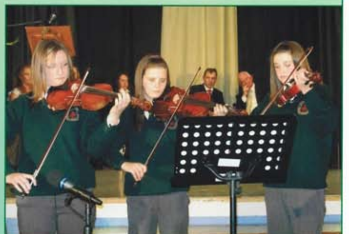
Musical Interlude: 1st and 2nd Year students demonstrate their vocal and musical talents at the Awards Night Ceremony